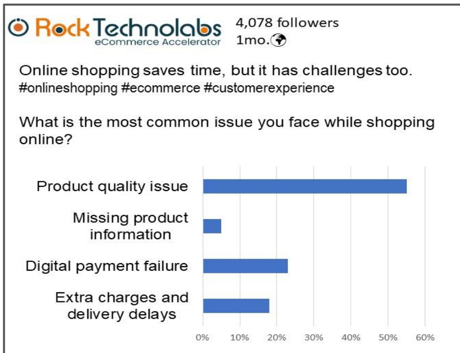
[Source adapted from: 13 Problems Customers Face While Shopping Online and How to Solve that? (rocktechnolabs.com)]

Describe the consumer’s responsibilities when buying appliances online to help prevent common issues. (4)